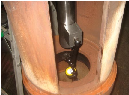
CV crosshead bushing sweep to assure concentricity following corrective action.