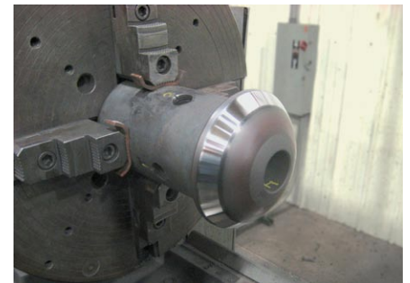
Valve disc following grinding and polishing.