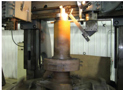
Truing cut being performed on stand for new balance chamber on control valve.