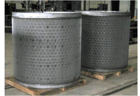
Intercept valve coarse-mesh screens replaced and ready-to-ship.