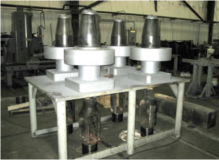
CV's assembled and coated with high temperature paint on non-steampath surfaces.