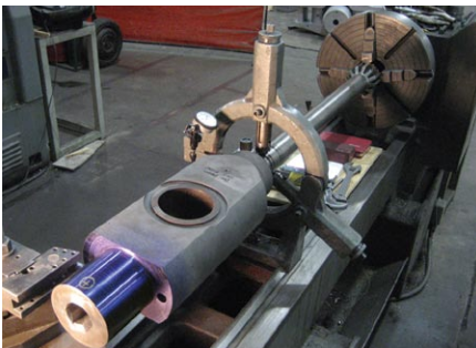
CV crosshead and stem set up to take truing skim cut.