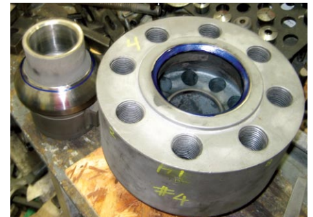
Successful blue check of MSV bypass valve and main disc.