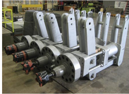
Restored control valves assembled and ready for shipment.